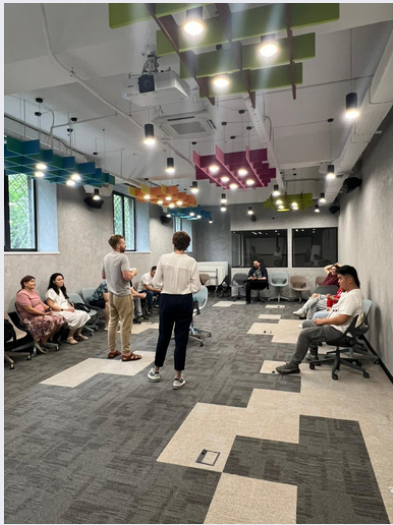
Oratorfest at NU Almaty Executive Campus

Oratorfest, the dynamic event that took place on August 26 from 13:00 to 18:30 at the Nazarbayev University Executive Campus in Almaty, was a tremendous success! Attendees had the privilege of experiencing a variety of engaging workshops led by expert trainers, exploring subjects including storytelling, feedback, project development, comedy improvisation, coaching, and acting. This event provided a golden opportunity for participants to enrich their speech skills and embark on a journey of personal and professional growth.